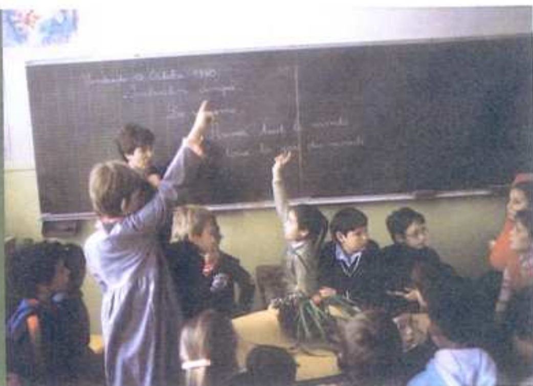
▲ Civics class on tolerance, France.

Source: PRRI, "Can Democracy be Taught?" Journal of Democracy , 14(4) October 2003.