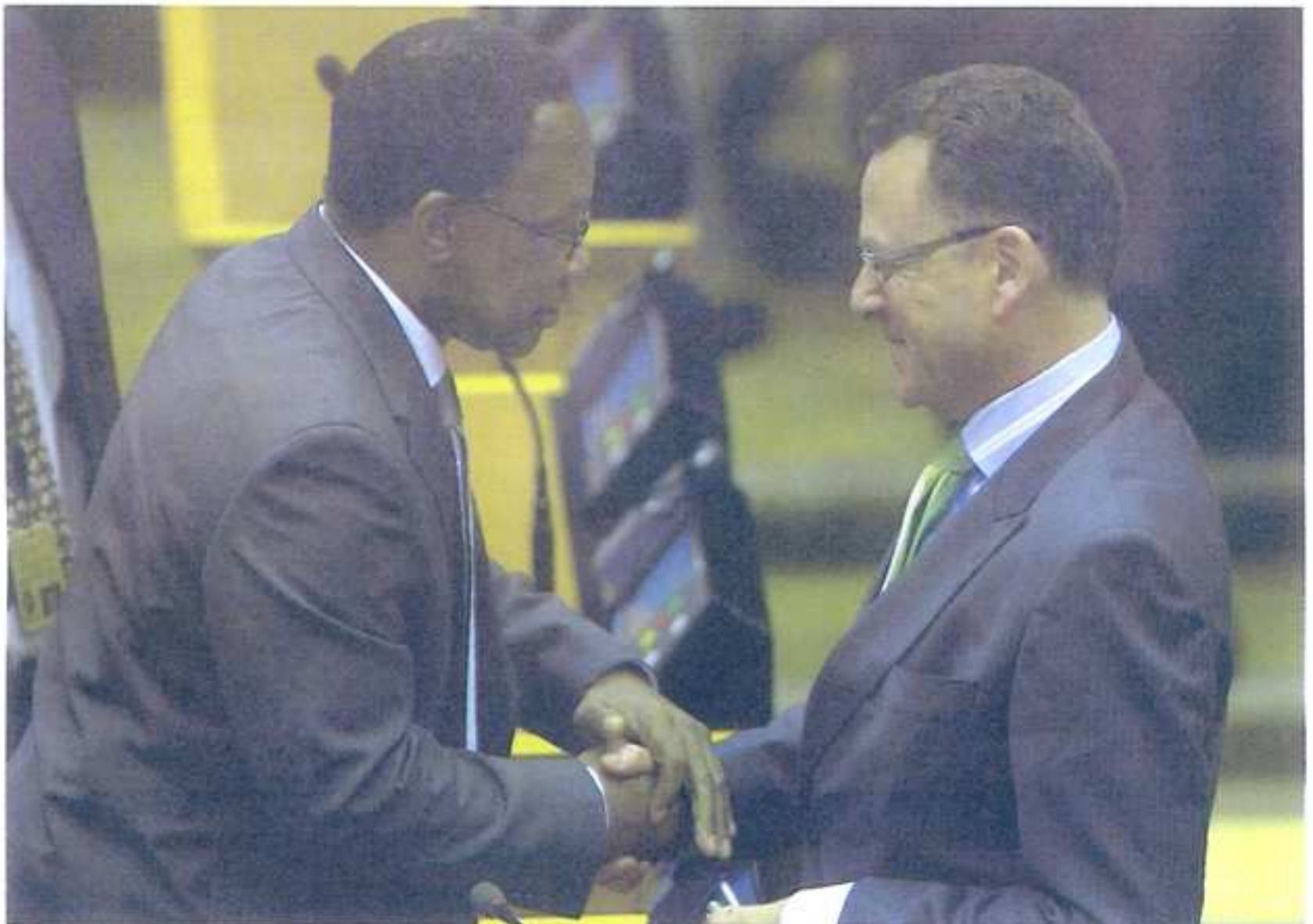
▲ Kgalema Motlanthe (ANC) and Tony Leon (Democratic Alliance), South Africa, September 2008.

Political tolerance is therefore essential to the functioning of parliaments and should be actively pursued in practice.