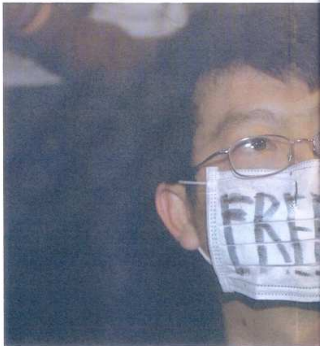
▲ Student protest against the military coup, Thailand, 22 September 2006.

—UN Special Rapporteur on the promotion and protection of freedom of opinion and expression E/CN.4/75/2002, January 2002