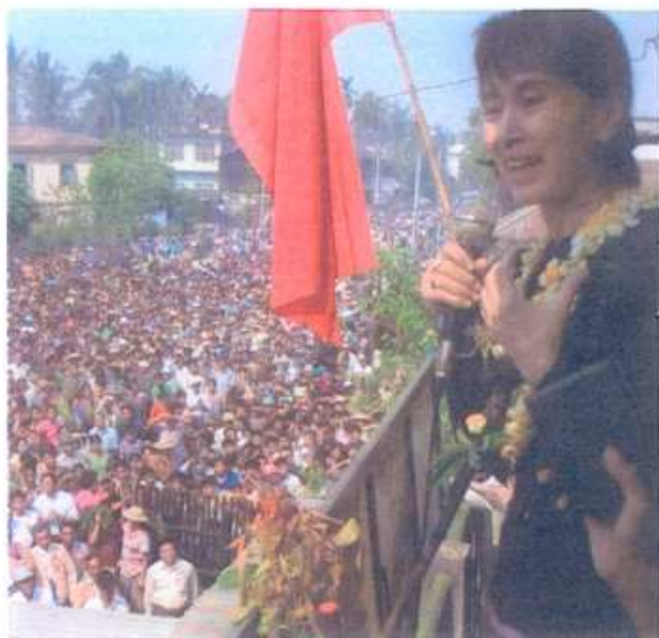
▲ Aung San Suu Kyi addressing a rally in Arakan state of Myanmar, December 2007