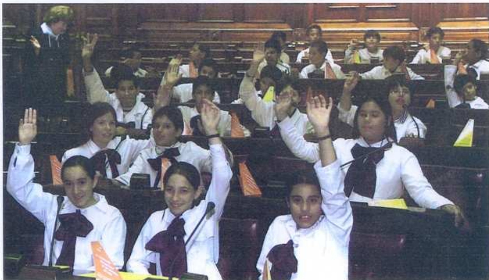
▲ Children's Parliament, Uruguay.