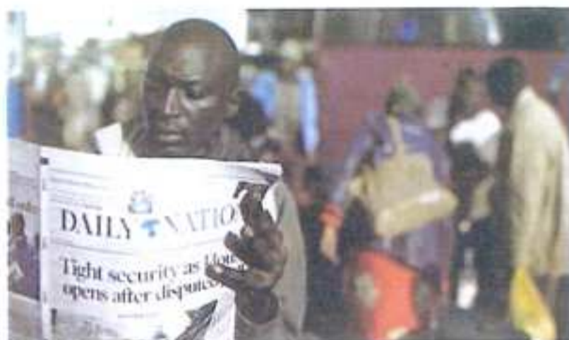
▲ Media reports on post-electoral violence, Kenya, January 2008.

A society in which freedom of expression is not guaranteed hinders political tolerance. Open dialogue and a diversity of political opinions are made possible by and reinforce a culture of tolerance.