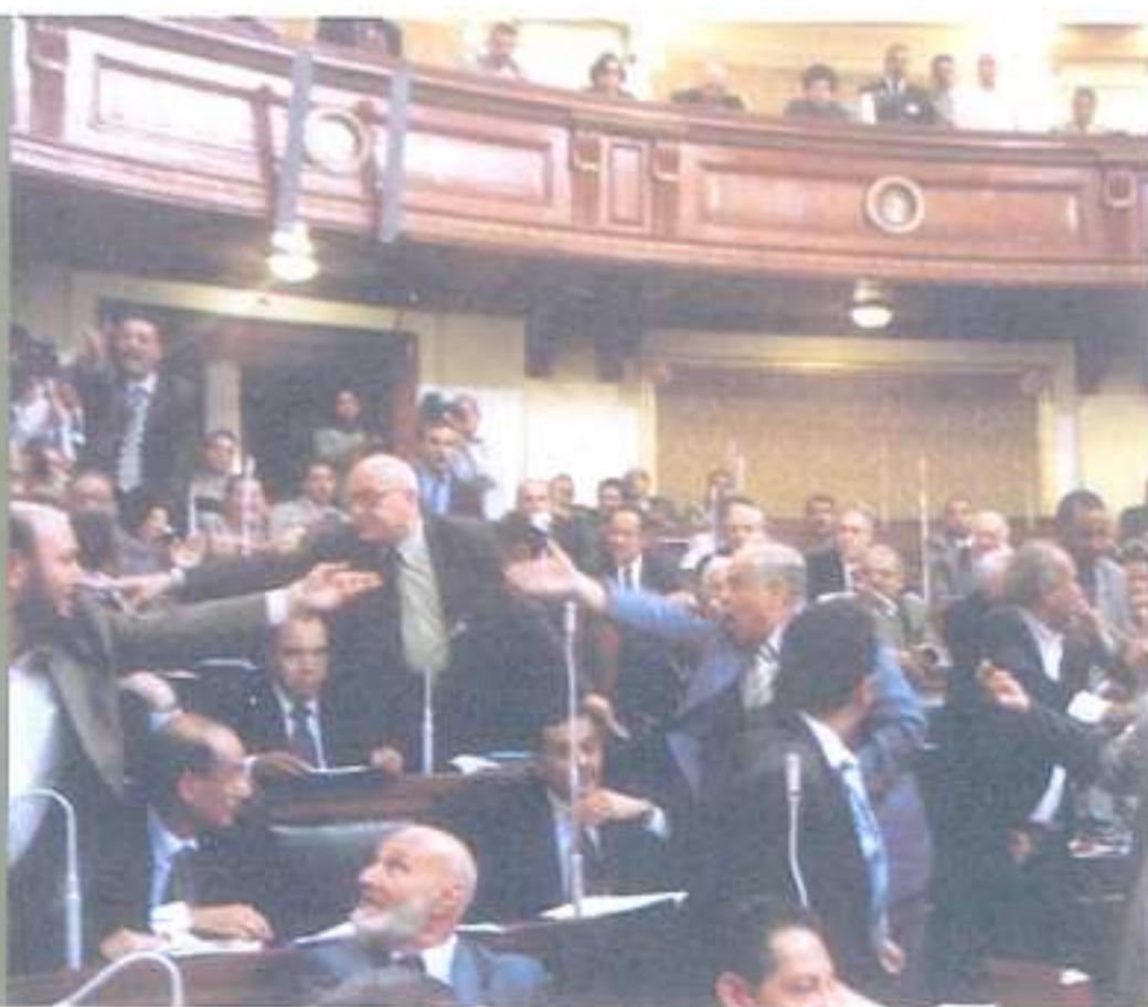
▲ Parliamentary session on constitutional amendments, Egypt, May 2005. © AFP Photo/STR

Source: Democracy of Parliamentary Elections 2008. IPU.